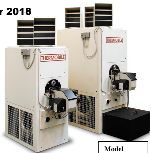
Model SB80 & 110