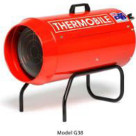
G29 & G38