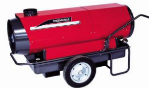
ITA 45 Robust