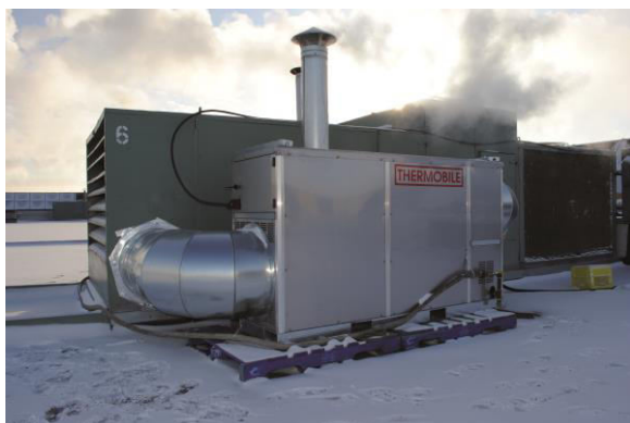
IMAC 4000 E

VALID FROM 1 st September 2018 Until 31 st December 2018