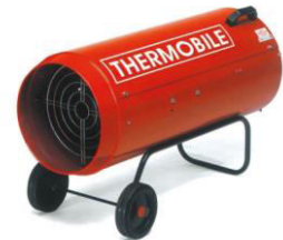
G57 & 81