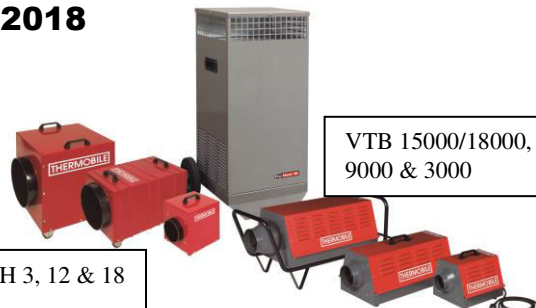
VTB 15000/18000, 9000 & 3000