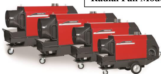
Radial Fan Models